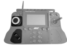
Focus / Zoom Set for SRH Remote Control Panel, K0.0019595