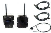
ERM-2400 2.4 GHz RXD-TXD Pro Set, SRH, KK.0040049