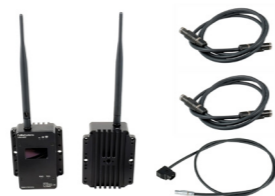
ERM-900 MHz RXD-TXD Pro Set, SRH, KK.0040050

For more details see Configuration Overview 8.6.0 & 8.6.1