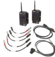
ERM-2400 Ext 2.4 GHz RXD-TXD Pro Set LCS, KK.0040048