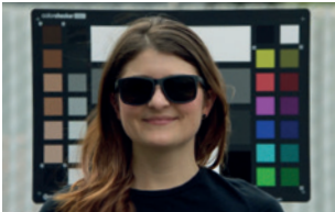
ARRI FSND 1.2