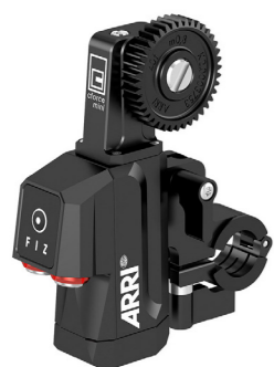
cforce mini Basic Set 2 KK.0040344