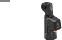
cforce mini Motor Unit K2.0006354