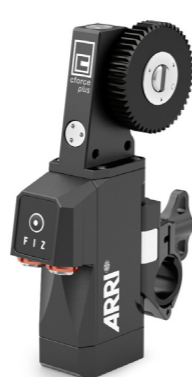
cforce plus (Basic Set) K0.0010103