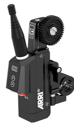
cforce mini RF Basic Set 2 , KK.0040345